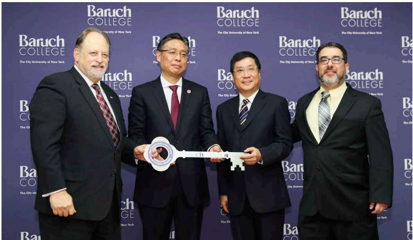
Confucius Institutes are quasi-independent academic departments that operate as a part of a host university, offering Chinese language and culture coursework, but are funded by the Chinese government. Despite their secretive partnership terms and restrictions on politically sensitive topics, Confucius Institutes are a compelling financial opportunity for many universities. Here, Baruch College in New York celebrates the opening of a new Confucius Institute focused on global finance.

Tightening higher education budgets have also exposed international academia to other sources of Chinese political influence. Most notable are Confucius Institutes, of which there are about 100 in the United States. Confucius Institutes operate as semi-independent academic departments on university campuses, offering for-credit language and cultural