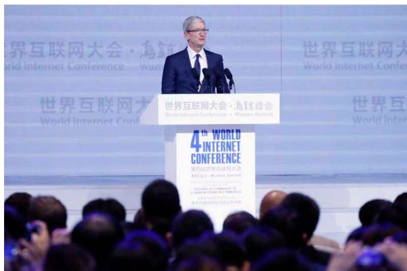
U.S. tech giants often cast themselves as quintessentially American companies, but make significant trade-offs on values of privacy and censorship in return for access to the Chinese market. Here, Apple CEO Tim Cook appeared for the first time at an annual conference in China meant to promote Beijing's vision of a more centrally controlled internet.

Google and Facebook, who years ago opted to exit and be blocked in lieu of administering censorship and surveillance on behalf of the government, are now looking for ways to tiptoe back into China. Eight years after abandoning most of its China-based internet services, Google plans to open a center on artificial intelligence research in Beijing. 44 In what was seen as a software olive branch,