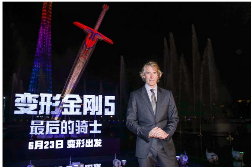
Chinese soft power and cultural prowess lags behind the United States, but the size of its market still projects influence. Here, director Michael Bay of the Transformers franchise attends an event in Guangzhou. The Transformers films in recent years have declined in the eyes of American audiences and critics, but live on due to their broad popularity in China.

And as in military competition, China cannot yet claim to match the United States' political, cultural, or economic prowess directly, but is quickly becoming “strong enough” to erode and undermine those institutions that depend on the superiority of American