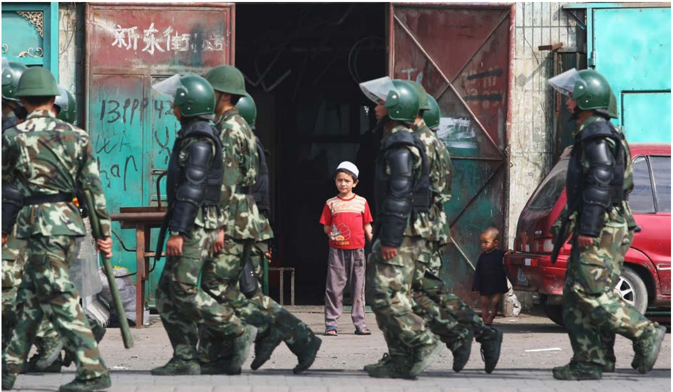
Research on China's western provinces and the proliferation of Beijing's domestic security apparatus there has been linked with Western scholars being denied visas to enter China. Here, Uighur children watch Chinese soldiers marching in Urumqi, Xinjiang Province.

Indeed, dangling permission to enter China is no longer needed to intimidate some corners of academia and publishing. In 2017, it was revealed that Cambridge University Press, the oldest publishing house in the world, had begun removing articles from the Chinese digital editions of its academic journals China Quarterly and Journal of Asian Studies . One local distributor of academic journals – and one seen as a crucial partner for foreign journals seeking to reach Chinese audiences – had reportedly demanded that articles covering issues like the Tiananmen Square protests, the Great Leap Forward, and the Cultural Revolution be removed in return for continued access to the Chinese market. 27 Though Cambridge University Press eventually reversed its self-censorship decision in the face of public outcry, individual scholars seeking to publish work on Chinese politics and overseas influence have continued to encounter squeamish publishers and editors around the globe. In Australia, where public debate about the extent of Chinese influence over their society has taken center stage, a book publisher declined to proceed with a prominent scholar's manuscript on Chinese efforts to influence Australian politics and society – over worries that they would be at the receiving end of those Chinese efforts to influence Australian politics and society. 28